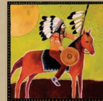
Warrior On A Red Horse – Spirit Rider Series, 2009

He is also one of the original contributors to the world-renowned “Trail of the Painted Ponies,” with his “Ghost Horse,” benefiting charities throughout New Mexico. His painting allows a unique focus and freedom to both honor and give back to his community.