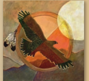
Spirit Wind North, 2009