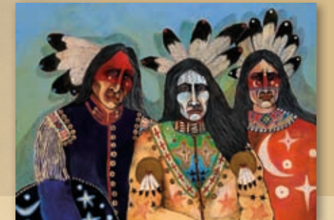
Three Wise Men, II, 2009

He is also one of the original contributors to the world-renowned “Trail of the Painted Ponies,” with his “Ghost Horse,” benefiting charities throughout New Mexico. His painting allows a unique focus and freedom to both honor and give back to his community.